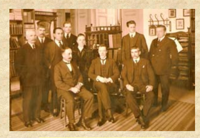
Fig. 4. The staff of the Instituto de Física

Some radio pionners in Argentina, year 1920, figures 7 to 11.