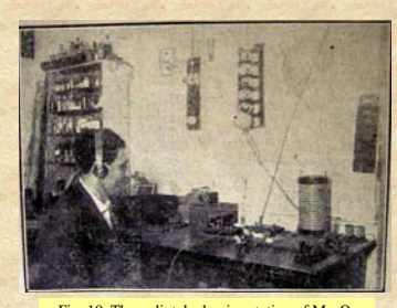
Fig. 10. The radiotelephonic estation of Mr. O. Duarte Indart